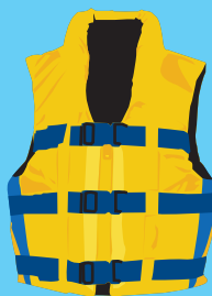
Personal Water Crafts & Water Sports (Intertently buoyant)