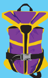
Kids (Adult life jackets don't fit kids)