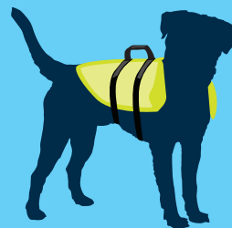
Pets (Harness with lift handles)