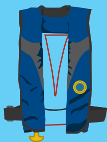
Anglers & Open Motor Boats (Suspender inflatable)